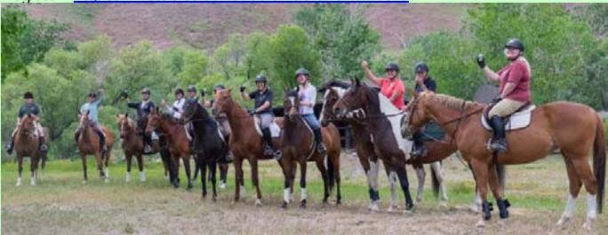
Adult Ride & Whine Camp this spring!

To register: http://mwstables.com/adult-ride-and-whine-0