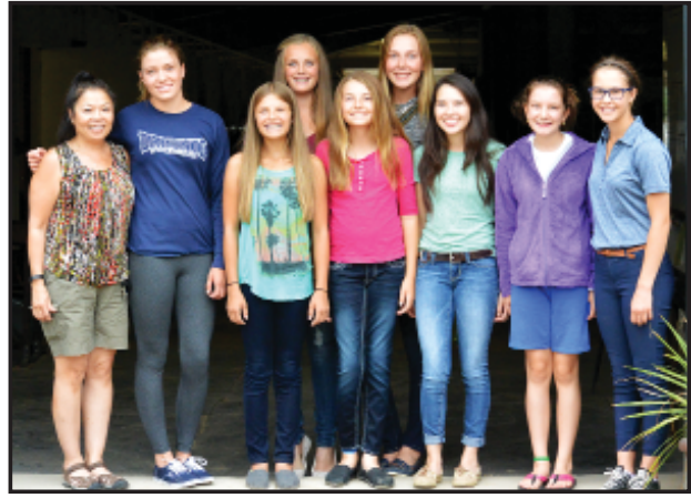
Youth Committee members met at Brownlee Equestrian in August.