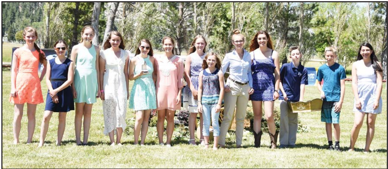
2016 Youth Committee members at the 2016 Franktown Meadows Hunter Derby.

Annual Clinic Academic Excellence Equitation Excellence Equitation Excellence High School Challenge Middle School Challenge FMHD Raffle FMHD Raffle Sportsmanship Award Sportsmanship Award Ride for Ribbons Annual Clinic