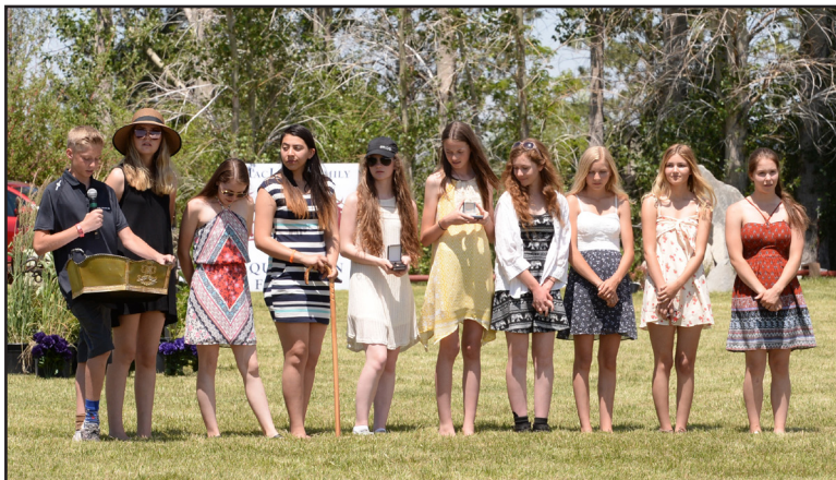
2017 Youth Committee members at the 2017 Franktown Meadows Hunter Derby.