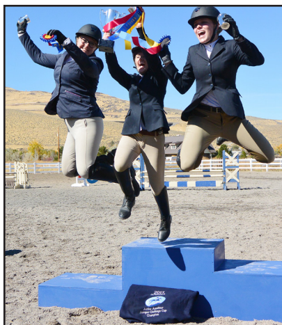
Three of a Kind celebrates their win!