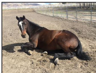
In Honor of Noelle