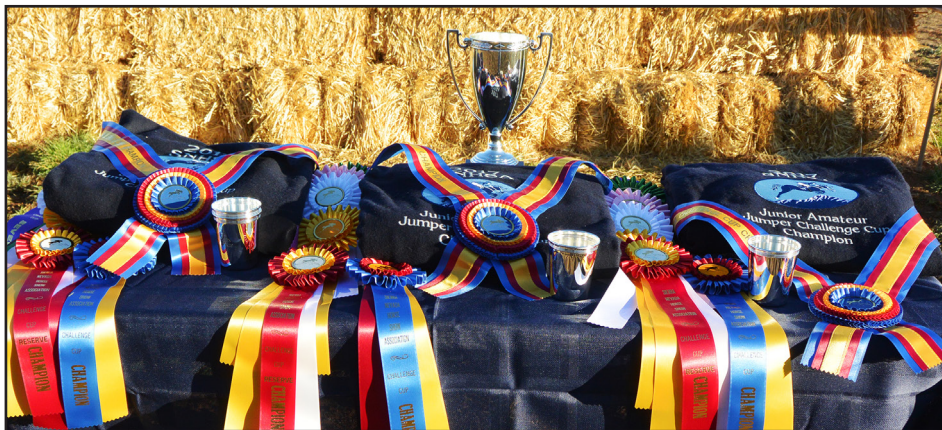
The first annual SNHSA JR/AM Challenge Cup prizes and ribbons