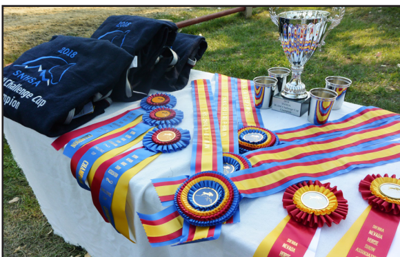
2018 SNHSA JR/AM Challenge Cup champions won a trophy, and each rider received a silver cup, a ribbon sash and an embroidered sheet.