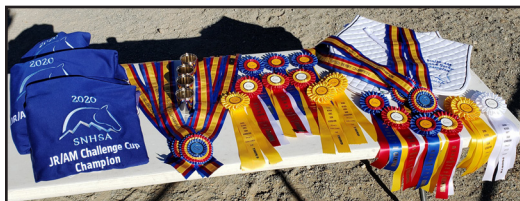
2020 SNHSA JR/AM Challenge Cup champions won a silver cup, a ribbon sash and an embroidered cooler. SNHSA Pro/Jr-AM Speed Derby champions won rider sashes and embroidered saddle pads.