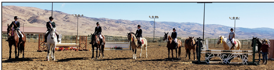
2020 SNHSA Challenge Cup Tournament teams