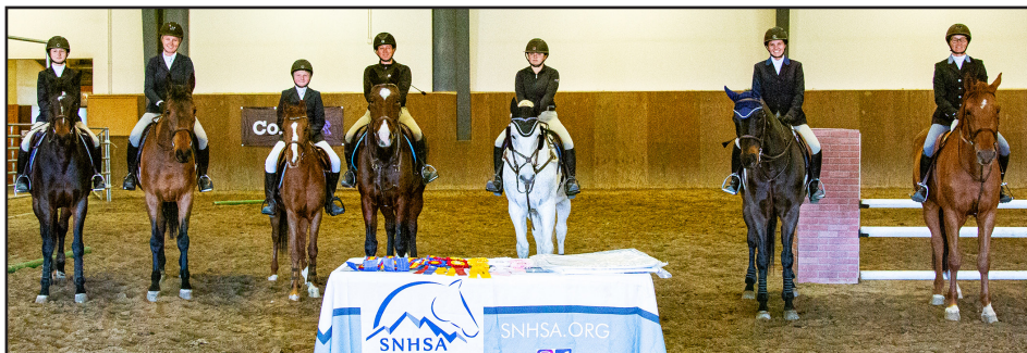
Five teams in the 2021 SNHSA Pro/JR-AM Speed Derby

The second rider waits in a marked area while the first rider completes their section of the course. Once the first rider has completed their course, they cross a line and the second rider leaves the marked area to complete their section of the course. A 4-second time penalty is added to the team’s overall time if they start too soon. Team prizes are awarded ribbons through 8th place.