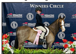
MacLean Sennhenn & Farmore Royal Gala