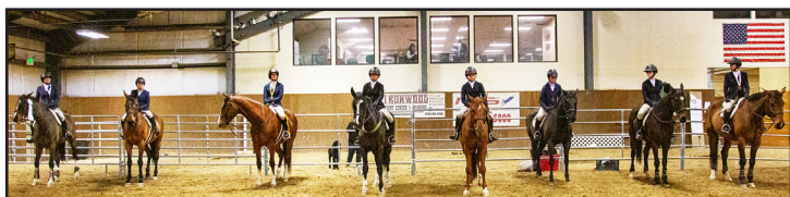
Eight riders competed in the SNHSA Mini Medal Final.