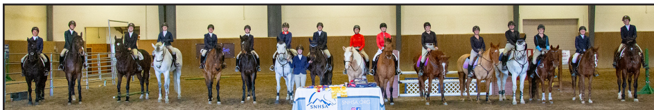
17 riders competed on eight teams in the 2021 SNHSA Challenge Cup Tournament