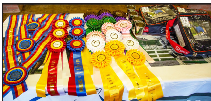
2021 SNHSA JR/AM Challenge Cup champions win a silver cup, a ribbon sash and coolers to be embroidered.

The winning team members were awarded a silver cup, a sash ribbon and a SNHSA cooler for each horse!