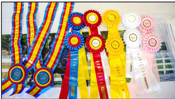
2021 SNHSA Pro/JR-AM Speed Derby champions win a ribbon sash and saddle pads to be embroidered.

The class is run as a speed class under Table III with faults converted to seconds. The first rider starts the clock as they cross the start line, and the second rider stops the clock as they cross the finish line. For each rail down, 4 seconds is added to the