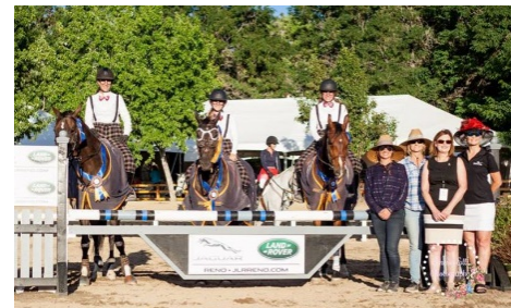
2018 $1,500 Jumper Derby Relay winners - Nerd Alert Team

Website Prize List Schedule Registration form (June 21 pre-entry deadline)