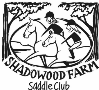
Shadowood Saddle Club Sponsor of the Equitation 13 & Under division