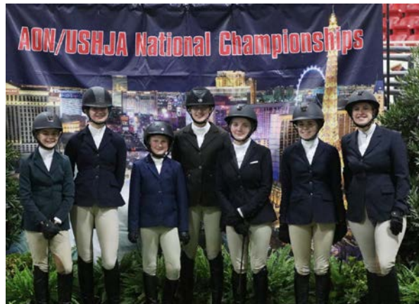
SNHSA riders who attended the USHJA Nationals

SNHSA sponsored six riders to attend the USHJA Nationals as Affiliate member qualifiers. The event was held at South Point Arena and Equestrian Center in Las Vegas, Nov. 11-17.