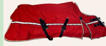
Before and After blanket pictures